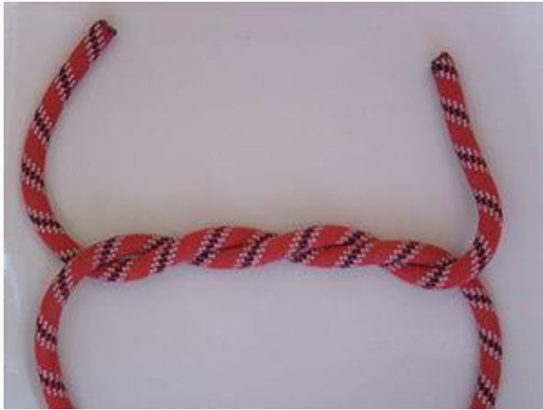
Double overhand knot